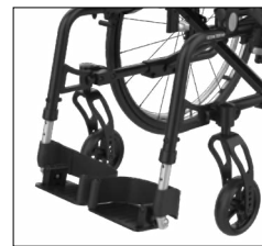
Length adjustable footplates