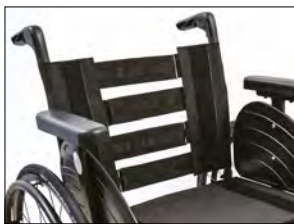
Tension adjustable back straps