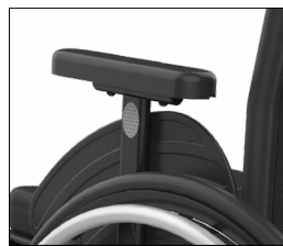
Height adjustable and removable armrests