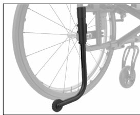
Anti-tip available as an accessory