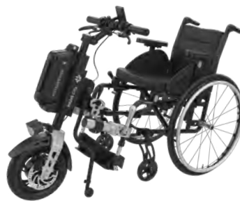
ICON 30 FAF is the ideal wheelchair for use with PAWS