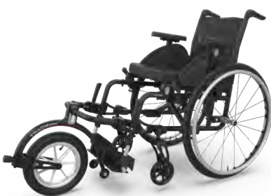
ICON 30 FAF with TRACK WHEEL (only for the Double Arm version)