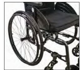
Lightweight wheels 24" x 1" incl. high pressure tire